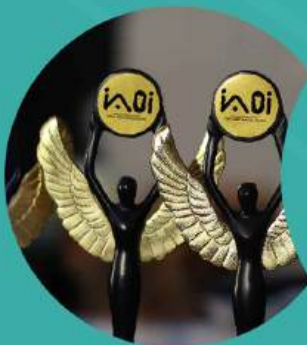
IAOI AWARDS OF EXCELLENCE