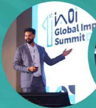
E POSTER PRESENTATIONS