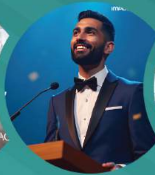
YOUNG IMPLANTOLOGIST FORUM