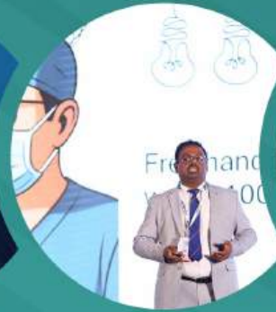
PRE CONFERENCE COURSE