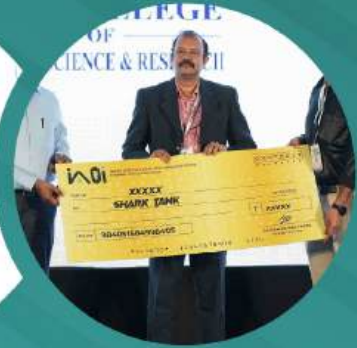
IMPLANT SHARK TANK