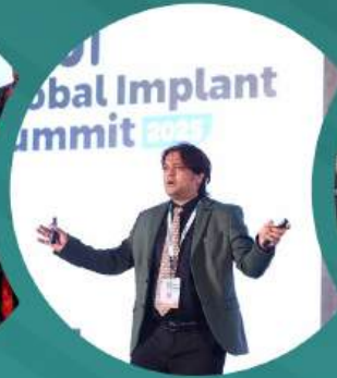
THEME BASED LECTURES