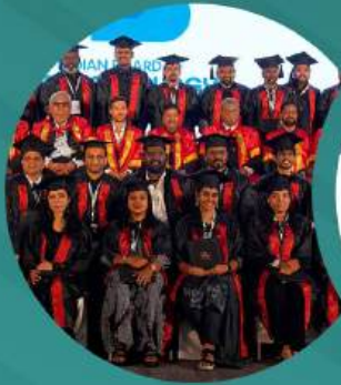
FELLOWSHIP AND DIPLOMATE AWARDS